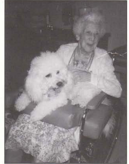
Sukoshi (an adult Bichon Frise whose name means "little one" in Japanese) has a special pillow to relax on when she comes to spend time with one of her friends at Integrated Health Services.

this community effort? Phone Pet Therapy at 366-2226.